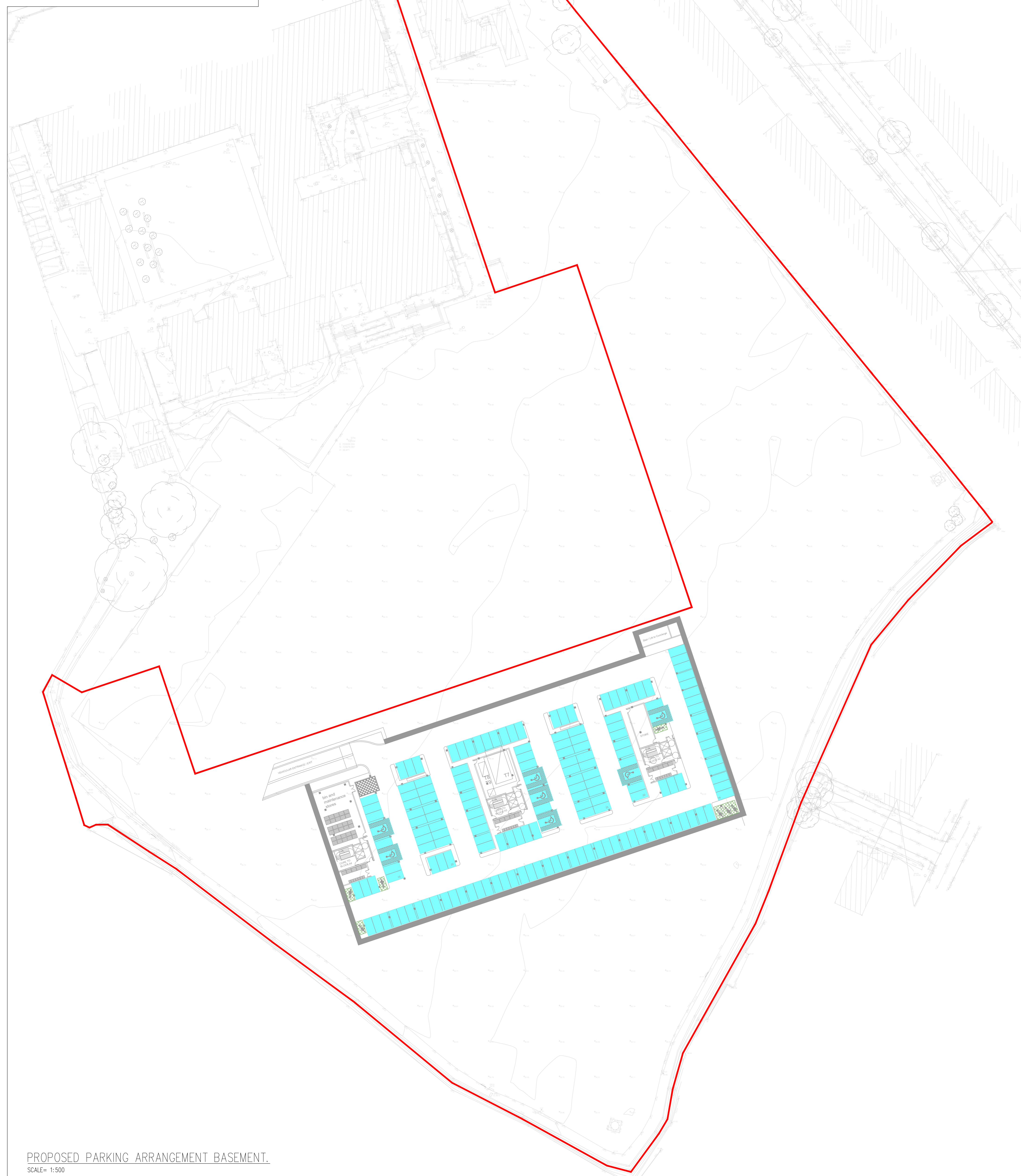
PROPOSED PARKING ARRANGEMENT BASEMENT. SCALE= 1:500